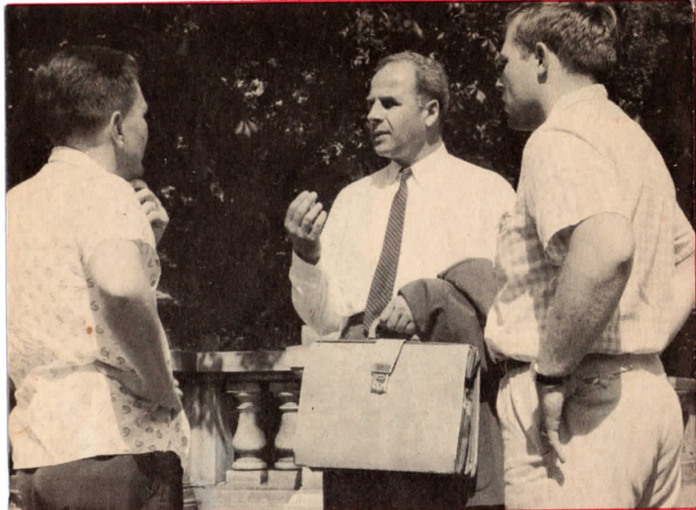
ON THE CAMPAIGN TRAIL, Gaylord Nelson hammers home a point. Nelson is INTERESTED in people, and has sought their personal opinions in every corner of the state.